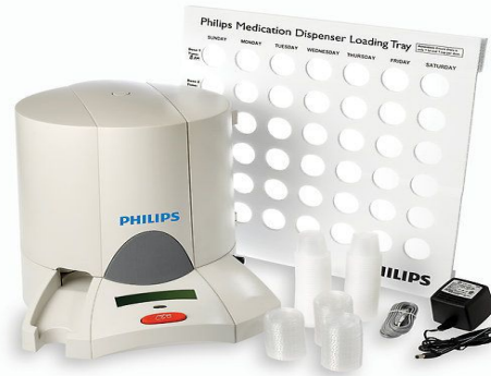
Figure 3: Philips' Medication Dispensing Service